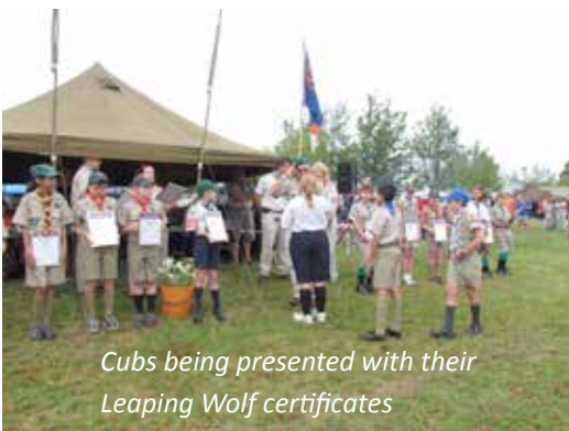
Cubs being presented with their Leaping Wolf certificates